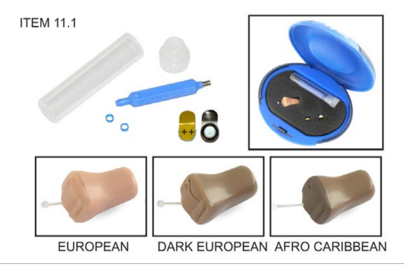
Item 11.1 – Micro Digital Wireless Earpiece (Smaller Size; Higher Noise Filtration)

The Micro Digital Earpiece is packaged within a miniature shell which is suitable for left or right side use. It utilizes the same high performance DSP circuitry as the LD5 Digital to allow reception of radio traffic in a covert manner when used in conjunction with a covert accessory (see Items 1, 2, & 3). Available in a range of skin tones and supplied with 2x batteries and 2x replacement wax traps with fitting tool.